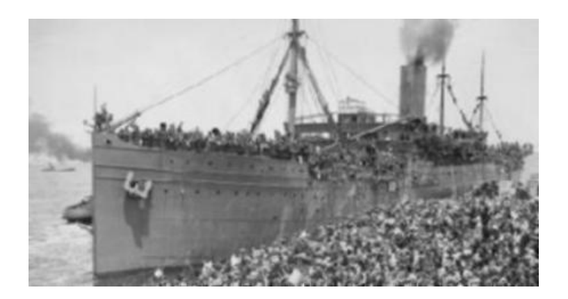
Transport A20 Hororata